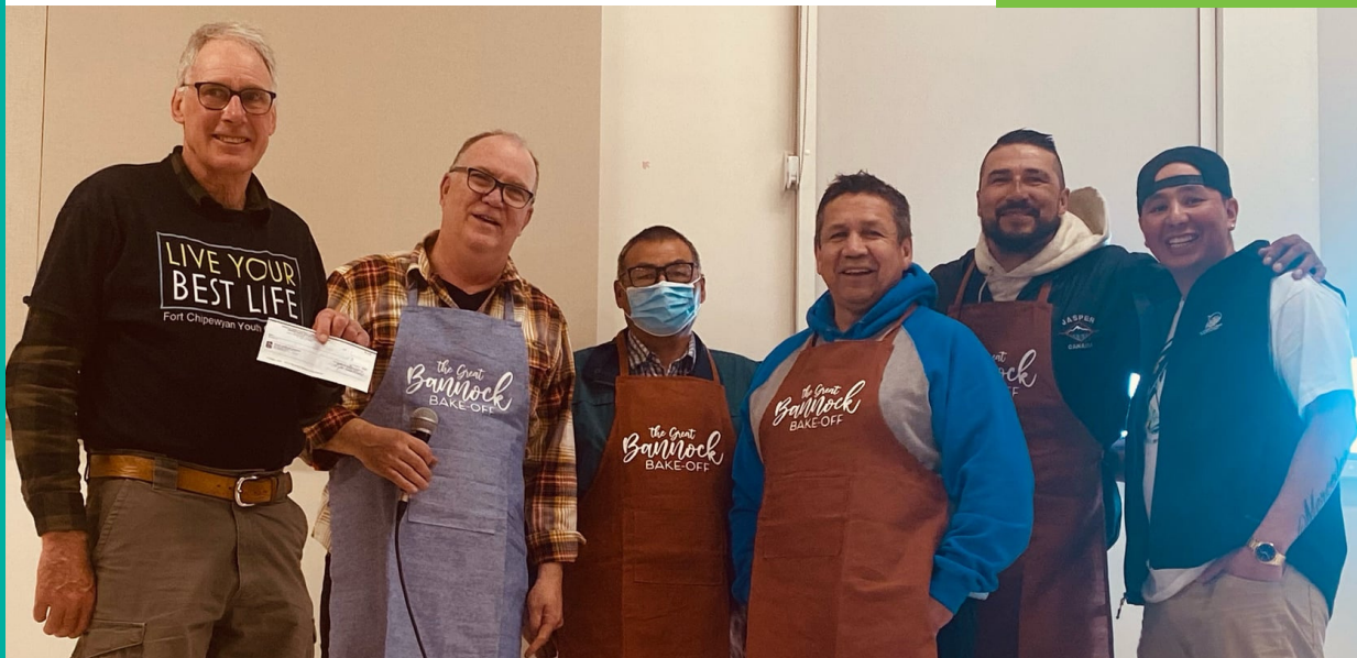
- The Great Bannock Bake-Off

The importance of community connections has certainly been highlighted throughout the pandemic. We are seeing how vital these programs are to mental health and a feeling of belonging.